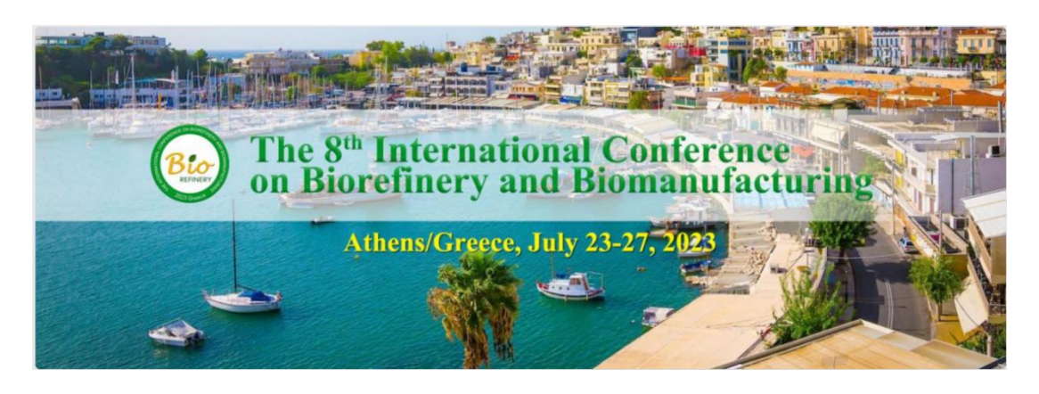
The 8th International Conference on Biorefinery and Biomanufacturing, ICB 2023